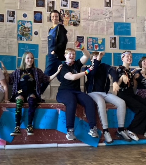
Image from Take Me To A Place Where Workshop