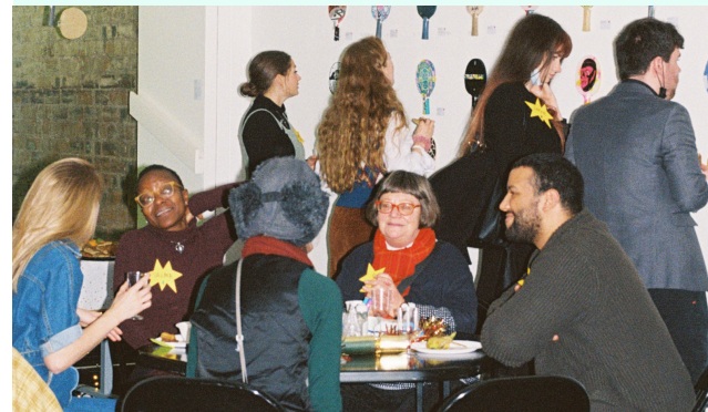
Image from #CreativeConnect Member's Festive Gathering, December 2021

GCAN hosted a variety of training, networking and 1-2-1 support sessions, mostly taking place online as we continued to navigate the Covid-19 pandemic.